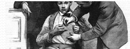
Joseph Meister the first vaccinate in 1885