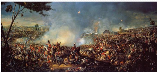
Waterloo June 18, 1815